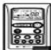
Wired Remote Controller (Option)