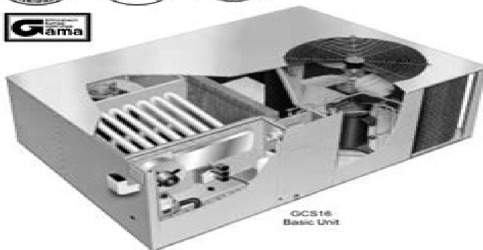
GCS16 Basic Unit