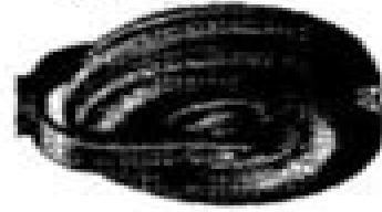
Single Front Wheel Attachment