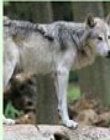
LOUP GRIS COMMUN (CANIS LUPUS LUPUS)