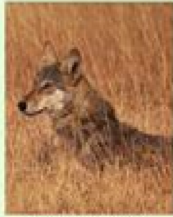
LOUP DES INDES (CANIS LUPUS PALLIPES)