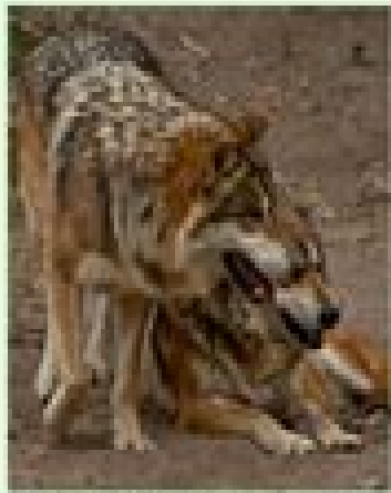
LOUP MEXICAIN (CANIS LUPUS BAILEYI)