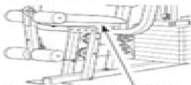
Serial Number Decal (Under Seat)

Write the serial number in the space above for reference.