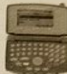
V200 Personal Communicator