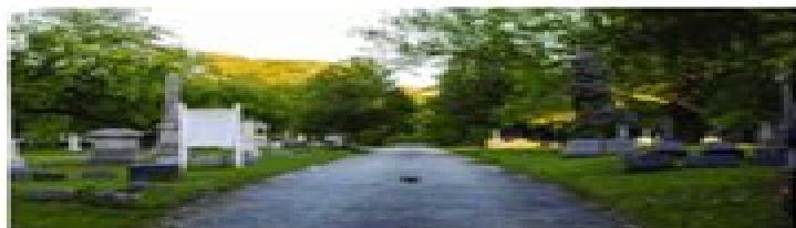
Modern glass of this portion of the building is a contrast to the historic architecture.