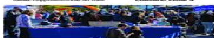
The annual tradition began at 10 a.m. Oct. 26 in Edgewater's Bowman Park.