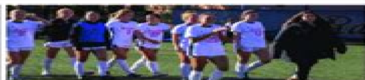
The women's soccer team will enter the Athletic Center to cheer on the Red Sox.