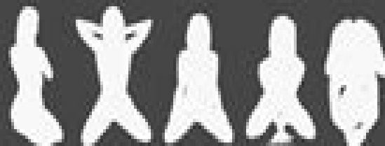
Upturned Curled Up Backs Ready To Please Prone