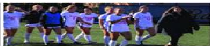
The women's soccer team will enter the Athletic Center to cheer on their Red Sox off with.