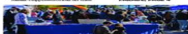
The annual tradition began at 10 a.m. Oct. 26 in Edgewater's Bowman Park.