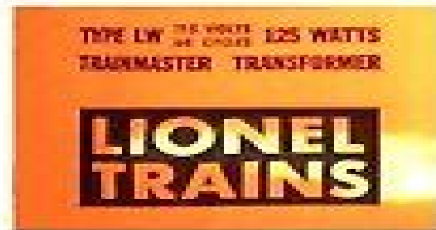
FOR TYPE LW