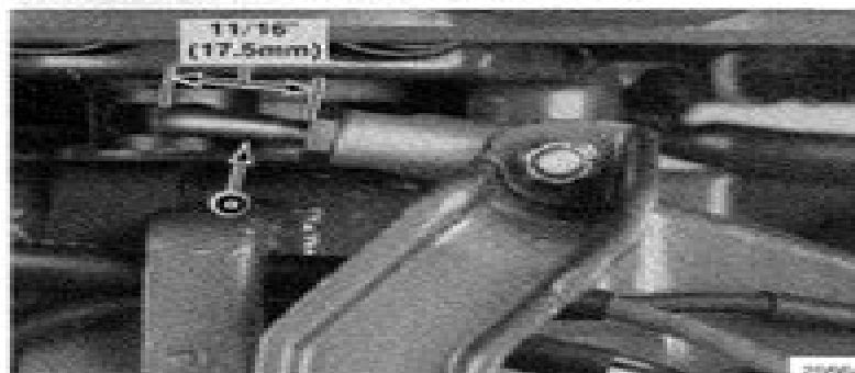
a - Trigger Link Rod

IMPORTANT: If trigger link rod was disassembled verify that 11/16 in. (17.5mm) is retained.