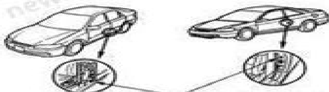
Vehicle Identification Number and Federal Motor Vehicle Safety Standard Certification. Vehicle Identification Number and Canadian Motor Vehicle Safety Standard Certification.