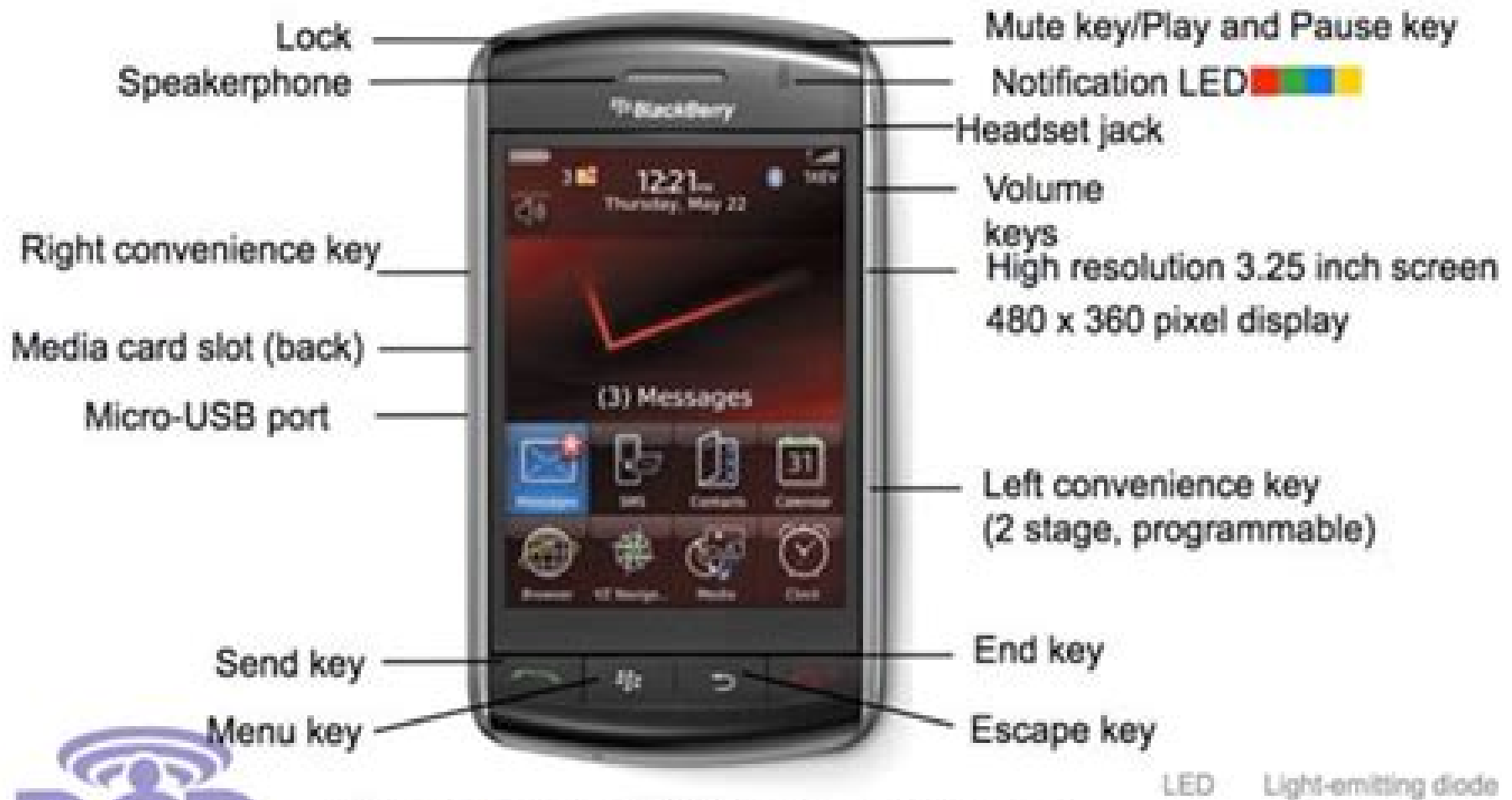
BlackBerry 9530 smartphone