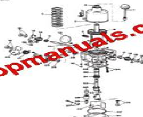
Fig. 1 COMPONENTS OF THE FULL HP CARBURETTOR