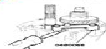
Fig. 3 Removing 5th selector roll pin