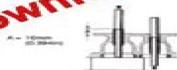
Fig. 8 REMOVING AND FITTING VALVE GUIDES