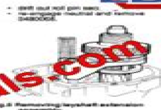
Fig. 5 Removing layshaft extension assembly