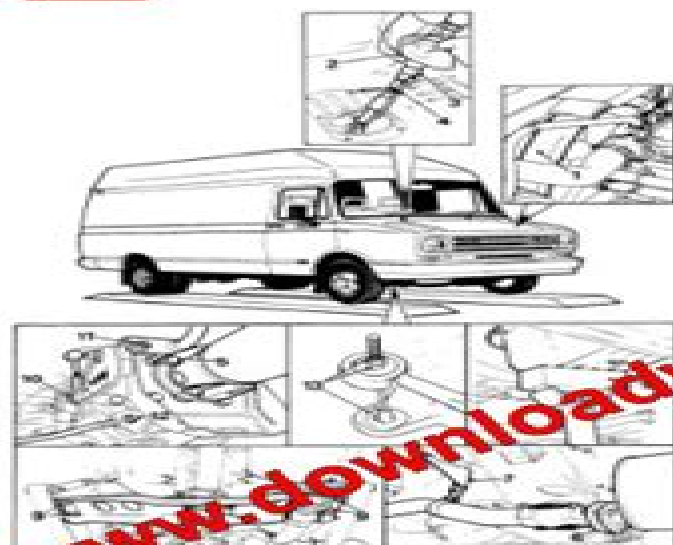
Fig. 1 Overview