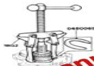
Fig. 4 Removing 5th gear