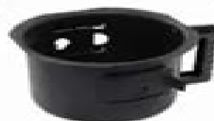
AZ002068 Ash Holder