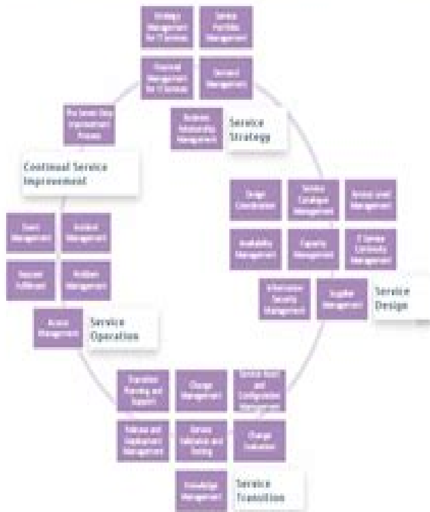
ITIL® V3 26 service lifecycle processes