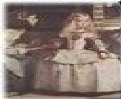
Las Meninas by Diego Velázquez