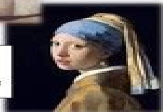
Girl with a Pearl Earring by Johannes Vermeer