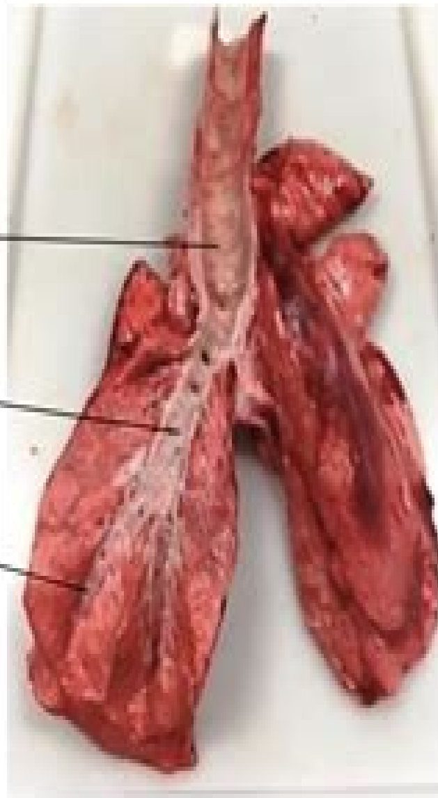
Figure 3a: Shows structure of the dissected right lung and trachea.