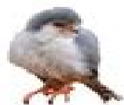
African Pygmy Falcon