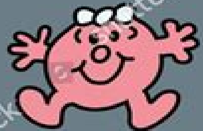
Little Miss Tiny