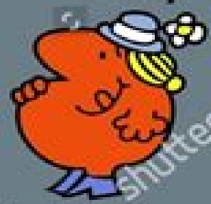
Little Miss Greedy