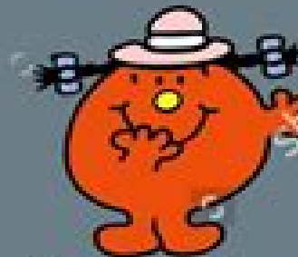
Little Miss Fickle