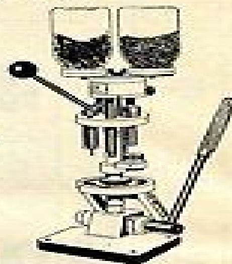
TABLE OF SHOT & POWDER BUSHINGS

Powder and shot charges are precisely-automatically-measured by means of these accurate bushings. Press comes with bushings for favorite load 121 grain Red Dot Powder, 1 1/4 ounces shot. See chart below for wide range of other precise bushings—use for every type of gun and type of shooting.