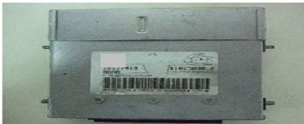
Conector da ECU

Veículos: Monza, Kadett e Ipanema, de 91 à 96