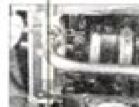
199-262-7600. Wash. State (200) (several) (cont.) 199-262-7600. Wash. State (200) (several) (cont.) 199-262-7600. Wash. State (200) (several) (cont.)