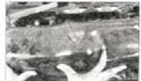
10.000. ... and then ...