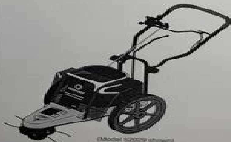
(Model 52029 shown)