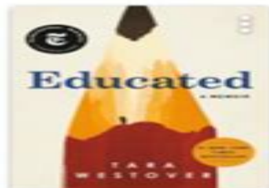
Educated: A M... $14.99