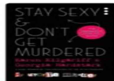
Stay Sexy and Don... $11.99