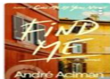
Find Me $13.99