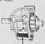
Position 3 Flax, Sunflower, and Soybeans.

To drill large size seeds, such as flax, sunflower, and soybeans.