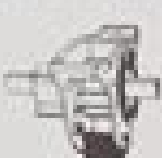
Position 4 Clean feed and pass over the seed.