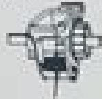
Position 1 Wheat, Barley, Corn, Soybeans, Sorghum, Millet, and other small seeds.

To drill wheat, barley, corn, soybeans, sunflower, sorghum, millet, and other small seeds.