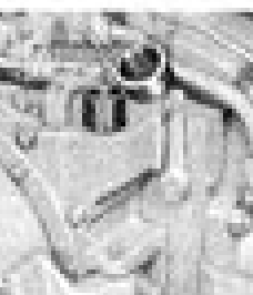
Figure 26-3—Diesel Engine Oil Filter