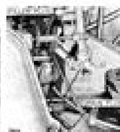
Cranking Engine Transmission Oil Plug