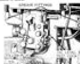
Figure 26-5—Power-Train Oil Plug and Oil Level Vent

If the tractor is equipped with Power-Train, open the oil level vent (Figure 26-5) and see if oil runs out. If it does not, add good clean SAE 14-W oil until it does.