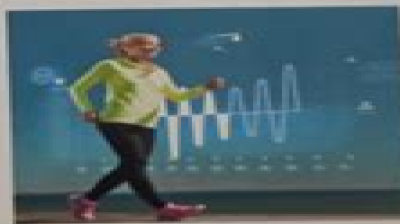
Vêtement connecté pour le sport