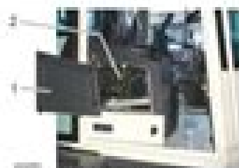
Fig. 386 Fuses in the driver's cab