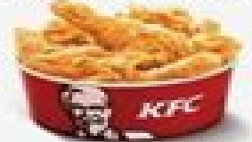
MIGHTY BUCKET FOR ONE