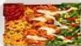
ORIGINAL RECIPE RICEBOX