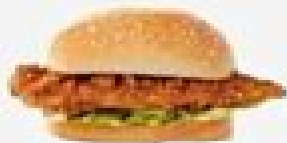
MINI FILLET BURGER