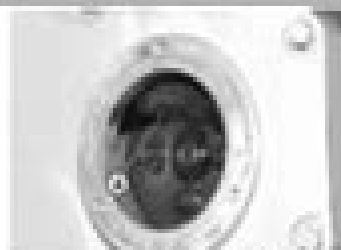
Figure 10-12: Removing Pin

For injection pump repair and testing, have an authorized diesel injection pump repair station perform the work. Unauthorized repairs made to the injection pump will void warranty.