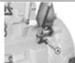
Figure 10-13: Aligning Pin

NOTE: When No. 1 cylinder is at TDC compression stroke, intake and exhaust valves for No. 1 cylinder will be closed and both rocker arms will be down.