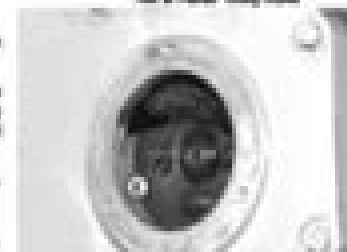
Figure 10-15: Injection Pump Timing Pin