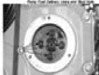
Figure 10-11: Looking into the Bore