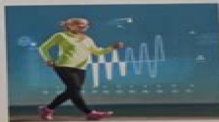
Vêtement connecté pour le sport