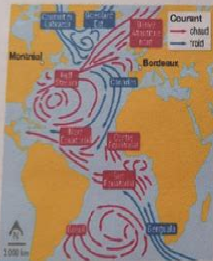
Doc. 4 Les courants océaniques en Atlantique.