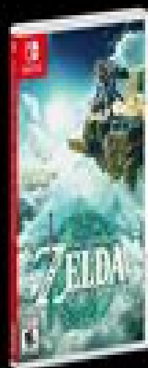
▷ Game / Juego