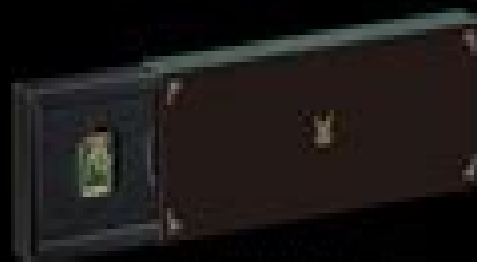
▷ Pin Set / Set de pinces