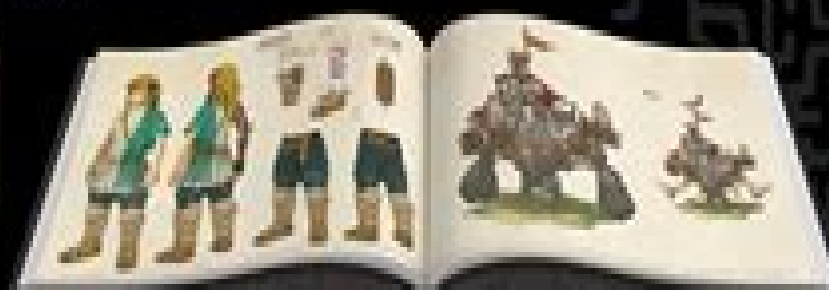
▷ Art Book / Libro de arte