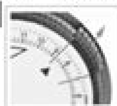
Fig. 27. Indstilling af tændingstidspunkter