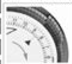
Fig. 26. Indstilling af klokkeslæt