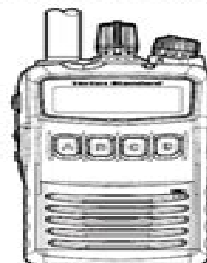
4 key Type