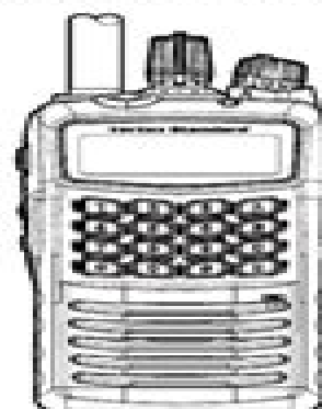
16 key Type

While we believe the information in this manual to be correct, VERTEX STANDARD assumes no liability for damage that may occur as a result of typographical or other errors that may be present. Your cooperation in pointing out any inconsistencies in the technical information would be appreciated.