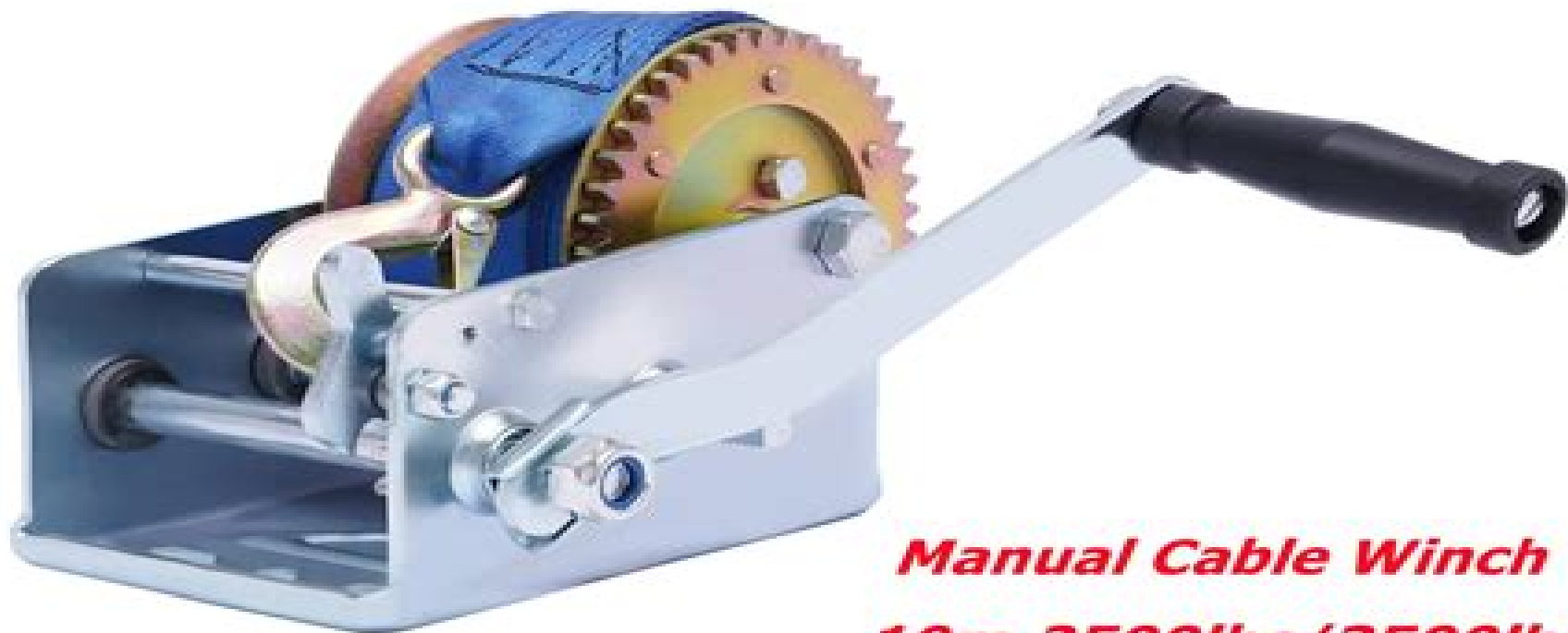
Manual Cable Winch 10m, 2500lbs/3500lbs