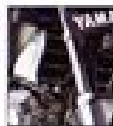
Teknik Cooling System