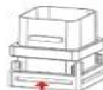
Steps C-F – Clean Windows