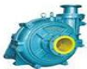
ZJ type centrifugal pump