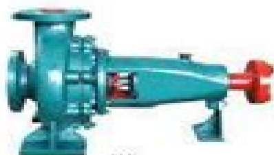
IS water pump