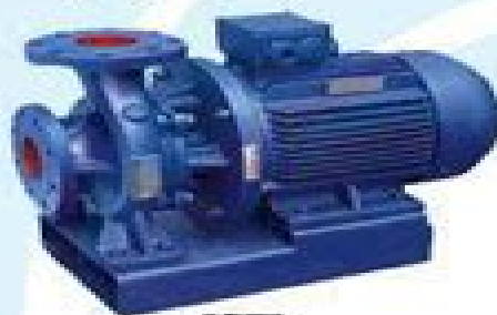
ISW pipeline pump