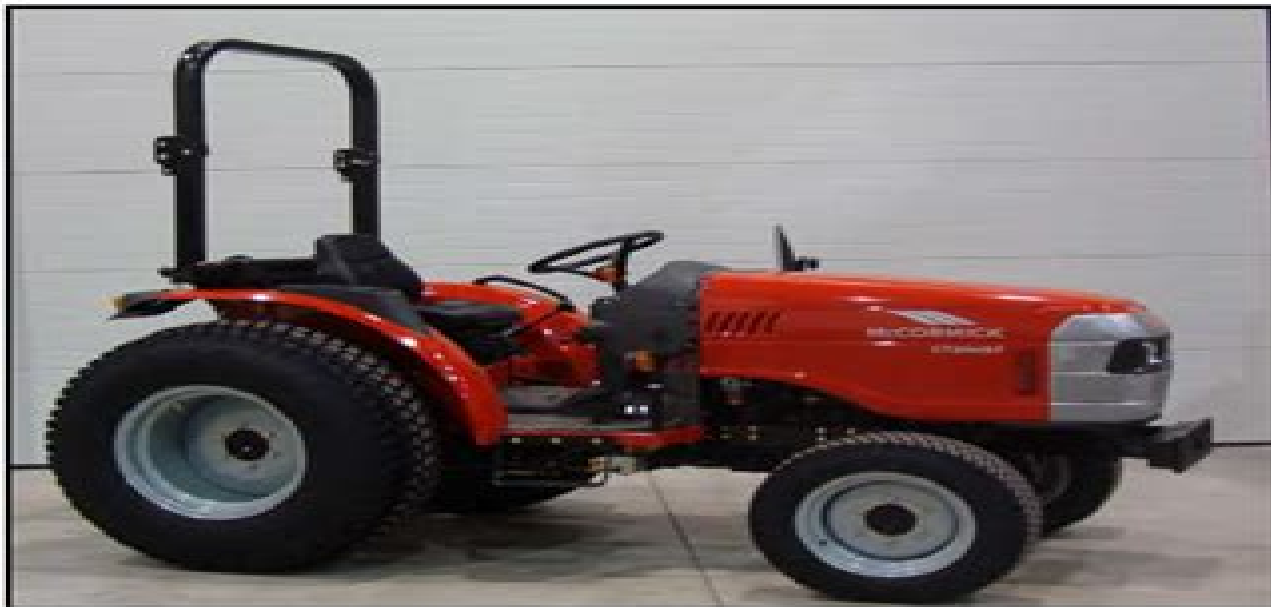
McCormick CT28 and CT36 Series Tractors