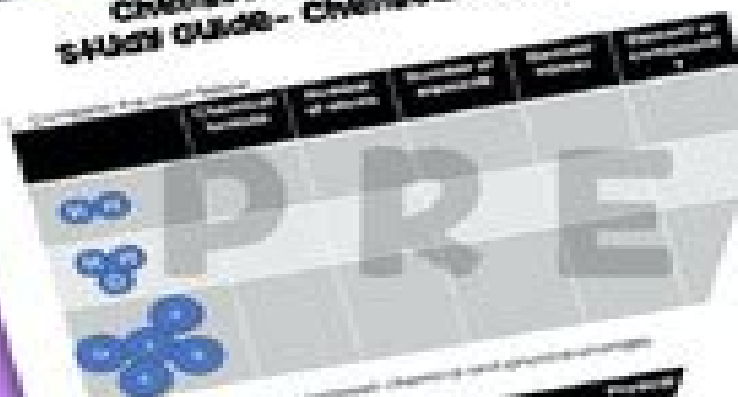
Table of Q&A CHEMISTRY INVESTIGATION 9 STUDY GUIDE - CHEMICAL EQUATIONS

1. Write the chemical equation for the reaction between hydrogen and oxygen.