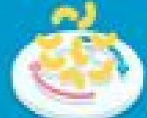
Changes in Microflora