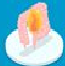
Inflammation in the Intestines