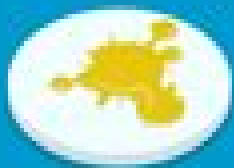
Mucus in the Stool