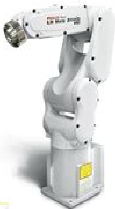
LR Matt 200/D45C Short arm, clean room, food grade grease ( integrated solenoid valves)