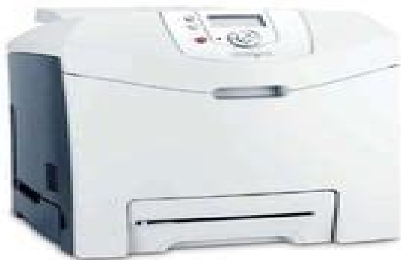
LEXMARK™ C522 COLOR LASER PRINTER