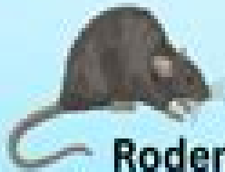
Rodentia (Rats, Squirrels)