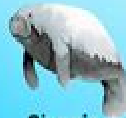
Sirenia (Manatees, Dugongs)