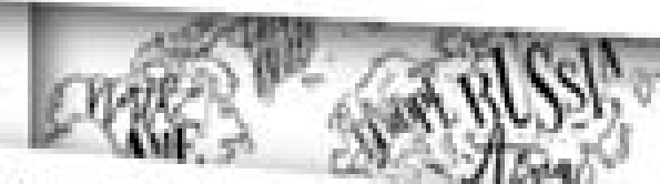
Map of the World