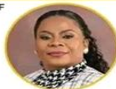
DIEKETSENG MASHEGO MEC FOR HEALTH