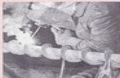
MAINTENANCE. Versatile for welding all types of work . . . carbon, alloy and stainless as well as non-ferrous metals.