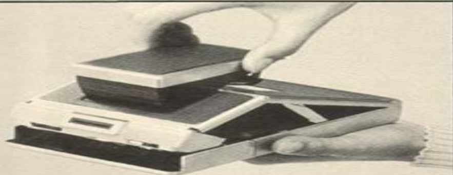
3. Pull straight up...